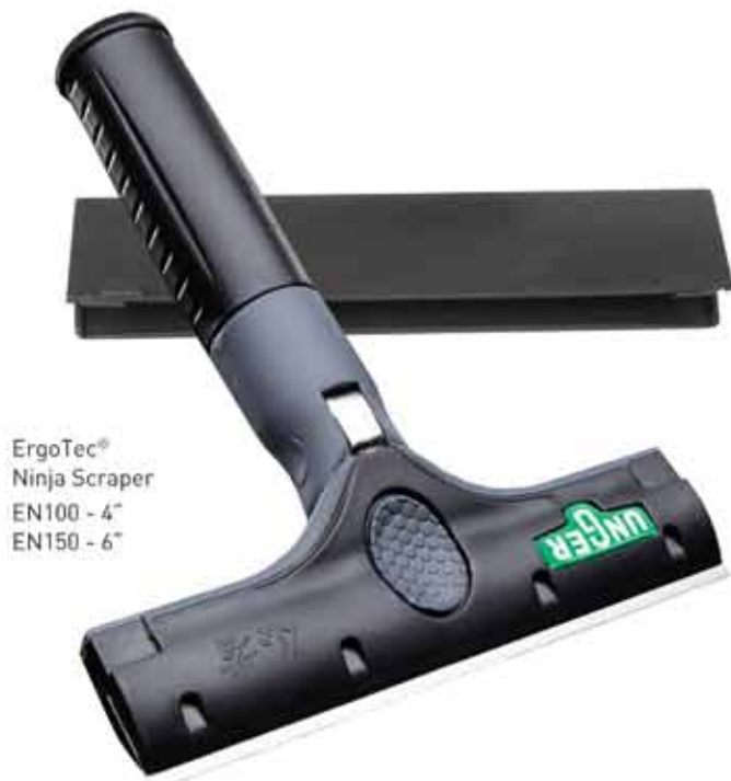
ErgoTec® Ninja Scraper EN100 - 4" EN150 - 6"