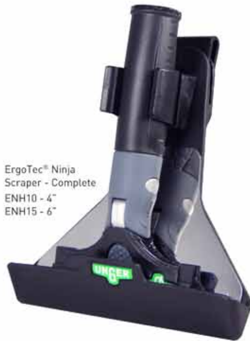
ErgoTec® Ninja Scraper - Complete ENH10 - 4" ENH15 - 6"